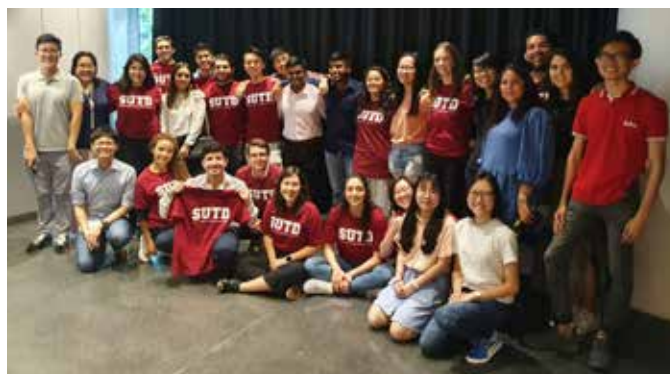
SUTD & Tec Monterrey's first winter programme

A series of targeted activities were scheduled to prepare the students for their assigned challenges. These included faculty-led workshops to stimulate 'Design Thinking', Entrepreneurship talks and site visits to Enterprise Singapore, Changi Airport Group (CAG), Port Singapore Authority (PSA), Urban Redevelopment Authority (URA), Surbana Jurong, to give the students insights and exposure to Singapore's infrastructure.