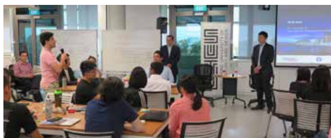
SMS Chee Hong Tat engaging with the Mexican students on SUTD campus

This experience reflects how corporate teams in global organisations work today and is very much in line with SUTD's philosophy of nurturing skills and attitudes in students that go beyond the knowledge taught in classrooms.