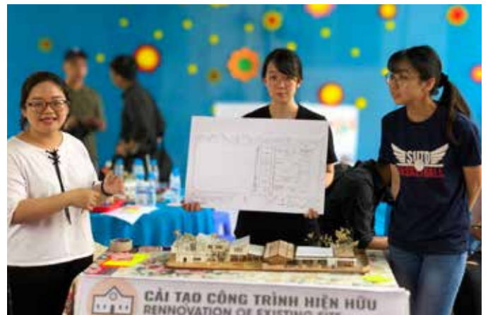
Students presenting their design ideas to the local community