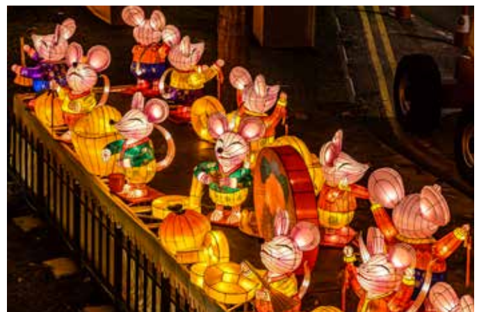
Design signifying Celebration & Family

The spectacular display included a total of 1,388 handcrafted lanterns that illuminated Chinatown. This is the ninth year that the Chinatown Street Light-Up is designed by SUTD students.