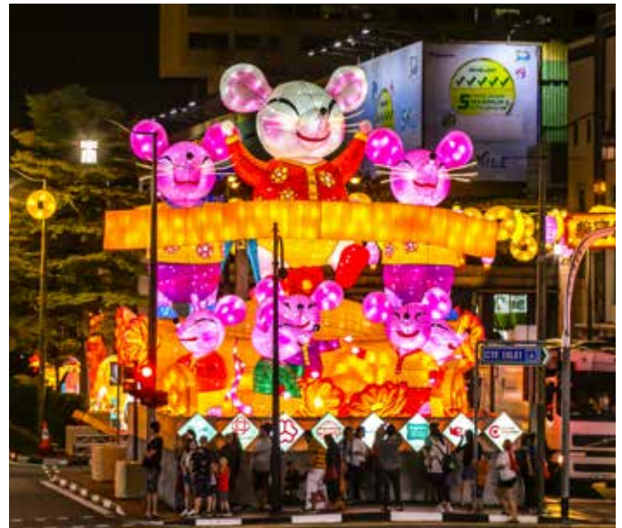
Year of the Rat Design Theme – Success

This year, SUTD once again collaborated with the Kreta Ayer-Kim Seng Citizens’ Consultative Committee to design the Chinatown Chinese New Year Street Light-Up.