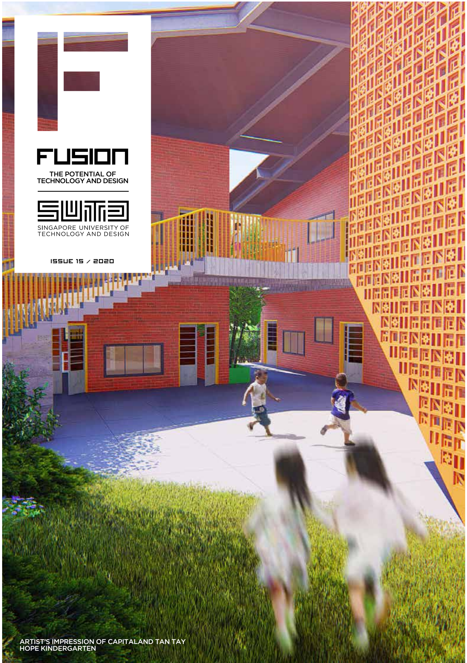
ARTIST'S IMPRESSION OF CAPITALAND TAN TAY HOPE KINDERGARTEN