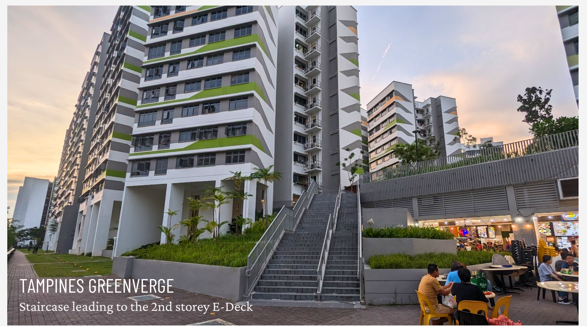
TAMPINES GREENVERGE Staircase leading to the 2nd storey E-Deck

IS PLACEMAKING DICTATED BY PLANNERS OR DRIVEN BY INDIVIDUAL AGENCIES?