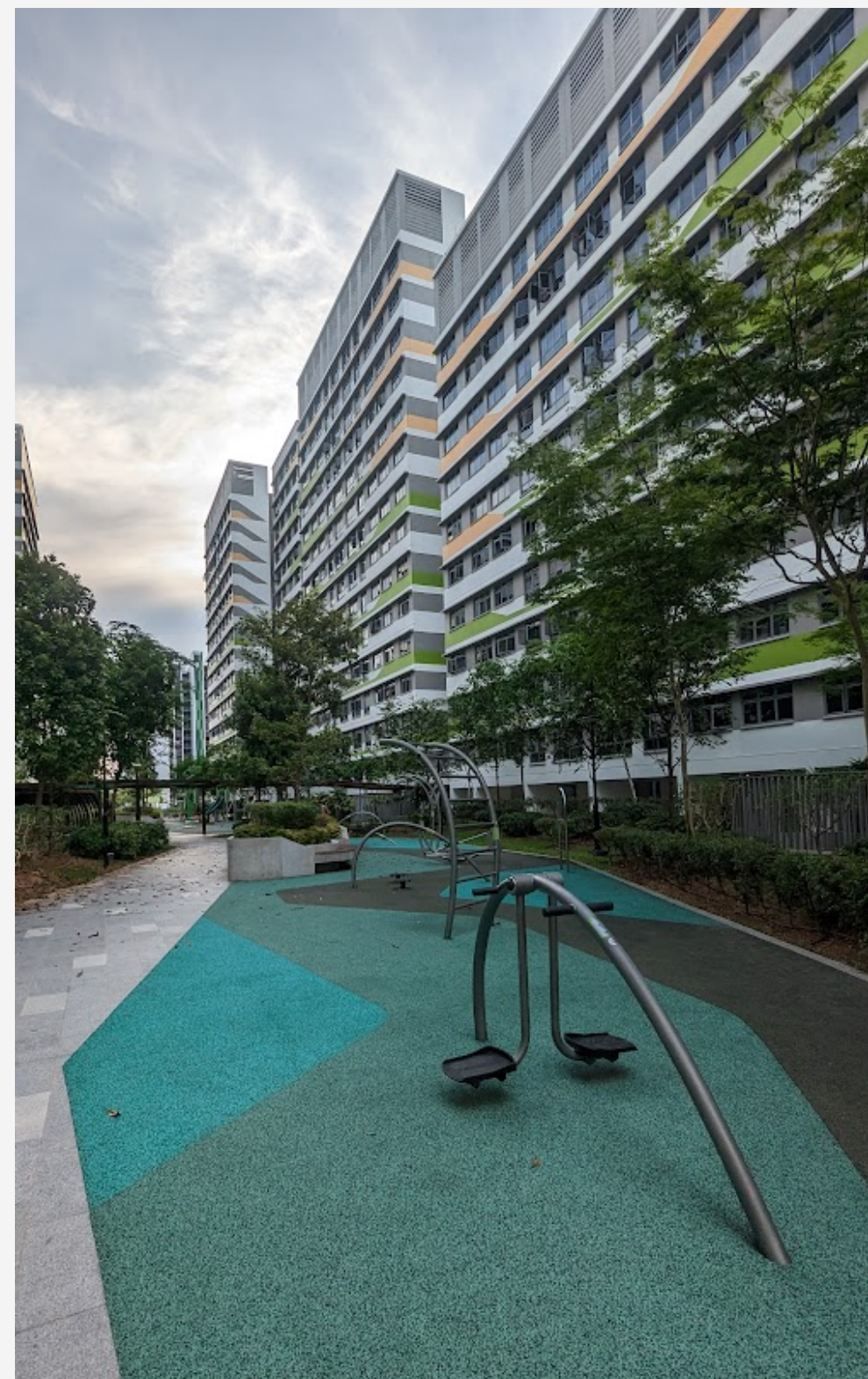
Fitness stations arranged linearly along the building orientation of Tampines Greenverge