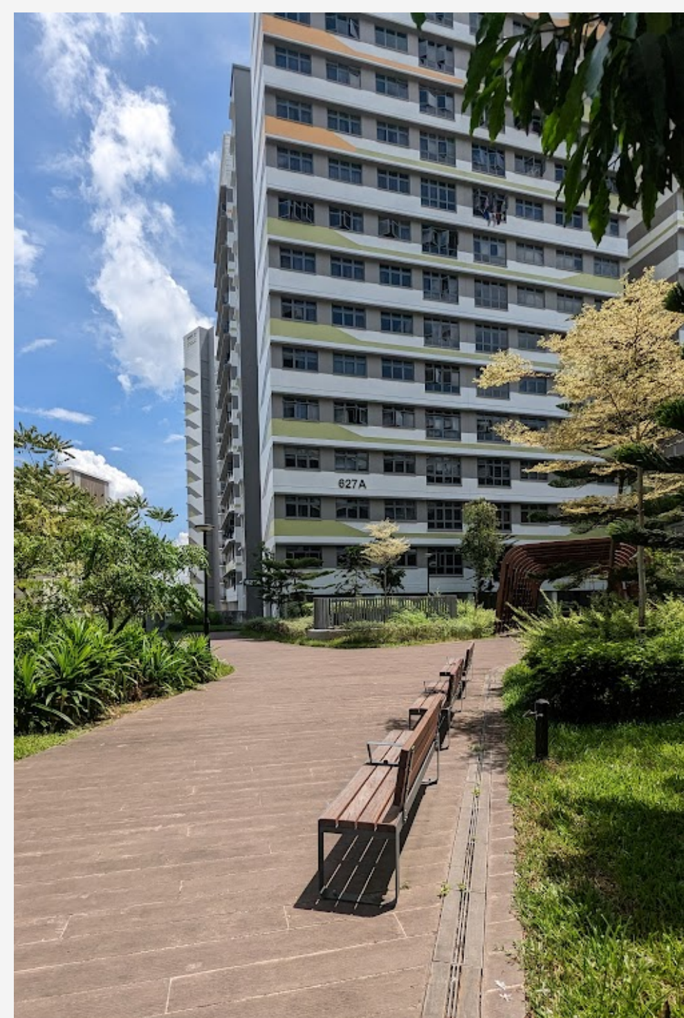
Seating areas along walkway exposed to the units above at Tampines Greenverge

AS WE CONTINUE ELEVATING OUR CITY, WHAT DOES THE FUTURE OF PUBLIC SPACE IN HDB LOOK LIKE?