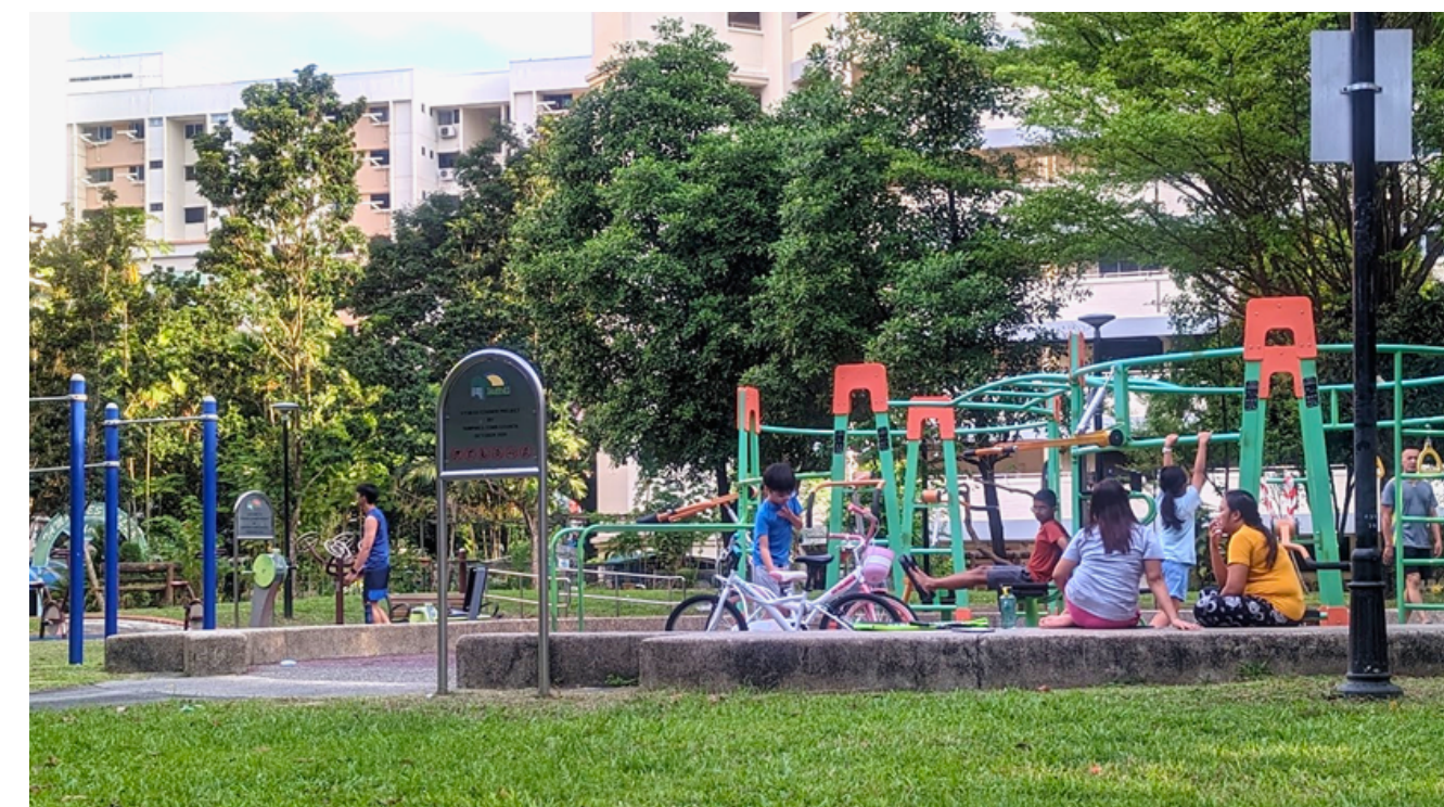
Children "invading" the fitness stations for their play in Tampines Central Park

Intimate spaces must be coupled with visibility to observe the surroundings and not be isolated from the rest of other activities.